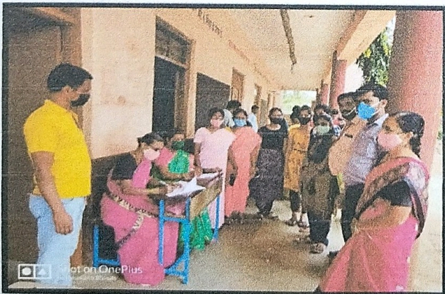
Participants in Fit India Movement Campaign