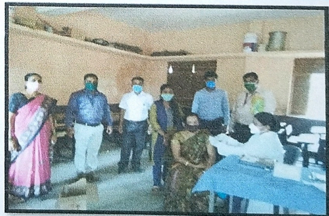
Staff could not resist temptation to give it a try!